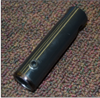
Blue Ox -Ready Brake Sling Adaptor #1001

If you have a Blue Ox tow bar and are using our Ready Brake this adaptor is a must have item.